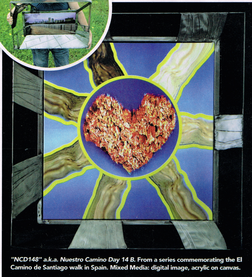
"NCD148" a.k.a. Nuestro Camino Day 14 B . From a series commemorating the El Camino de Santiago walk in Spain. Mixed Media: digital image, acrylic on canvas.