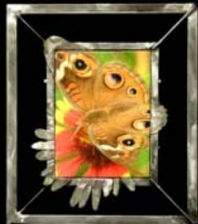
My What a Big Proboscis You Have!