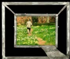
Hey You in the Brown Hat, Where Ya Goin?