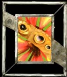
Eyes Are Watching