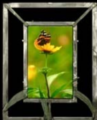
Butterfly in Action