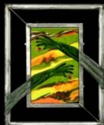
I Almost Have You