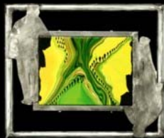
Army of Men