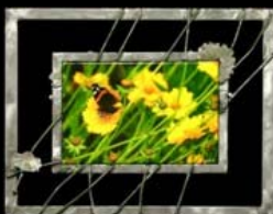
Just Resting for a Sec, & Then I'm Gone